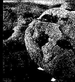
GLUTEN FREE CHOCOLATE CHIP*

Moist oatmeal cookie loaded with raisins. It's Gluten Free-licious ™ ! *2 lb Avena con Pasas (sin gluten)