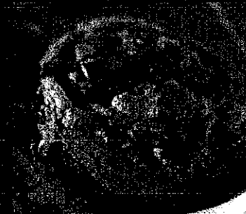
CHOCOLATE CHUNK PECAN*

Perfect cookie to roll out and decorate. (Azucar)