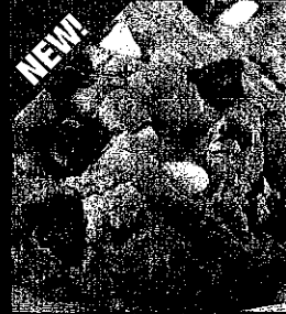
GLUTEN FREE PECAN BLONDIE*

Loaded with semi-sweet chocolate chips. Indulge, it's Gluten Free-licious ™ ! *2 lb Chispas de Chocolate (sin gluten)