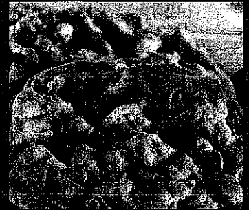
DBL PEANUT BUTTER CHOCOLATE CHIP

Chewy yet crispy, loaded with rice crispies, coconut and pecans. (Coco con Pecans) *2.5 lb