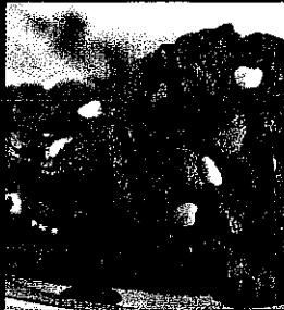
GLUTEN FREE COOKIES & CREAM*

Gluten Free-licious Ready-to-Bake Cookie Dough