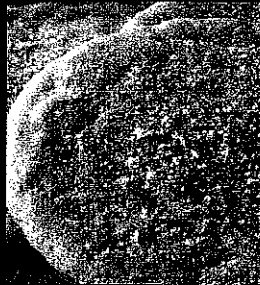
GLUTEN FREE SUGAR*

Loaded with semi-sweet chocolate and white chocolate drops. Wonderfully rich and creamy tasting. *2 lb Trozos de Chocolate Triple (sin gluten)